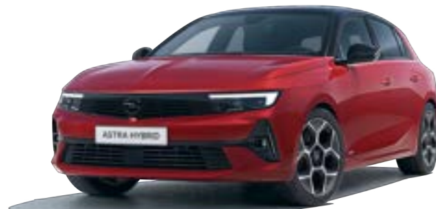
RUBY RED - SPECIAL