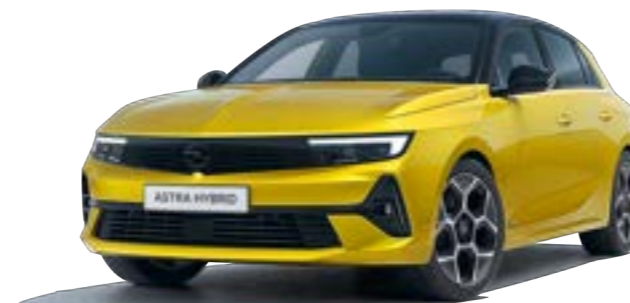
AMBER YELLOW - METALLIC