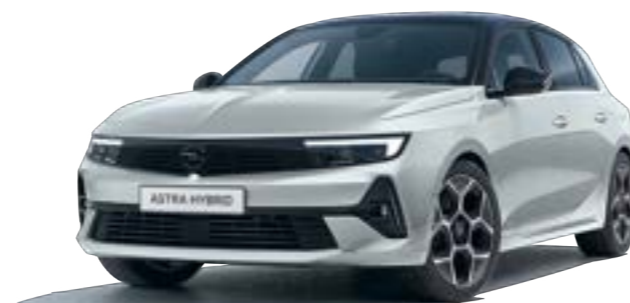
CRYSTAL SILVER - METALLIC