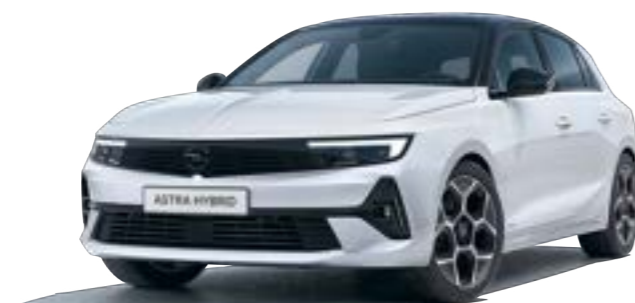
JADE WHITE - SOLID