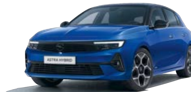
COBALT BLUE - PEARLESCENT