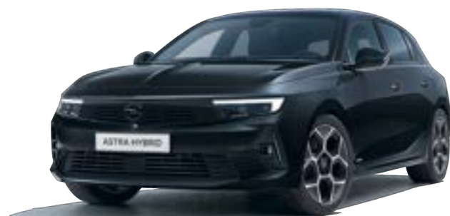
CARBON BLACK - METALLIC