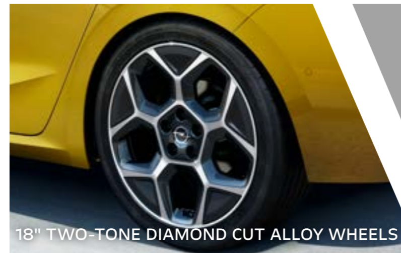
18" TWO-TONE DIAMOND CUT ALLOY WHEELS