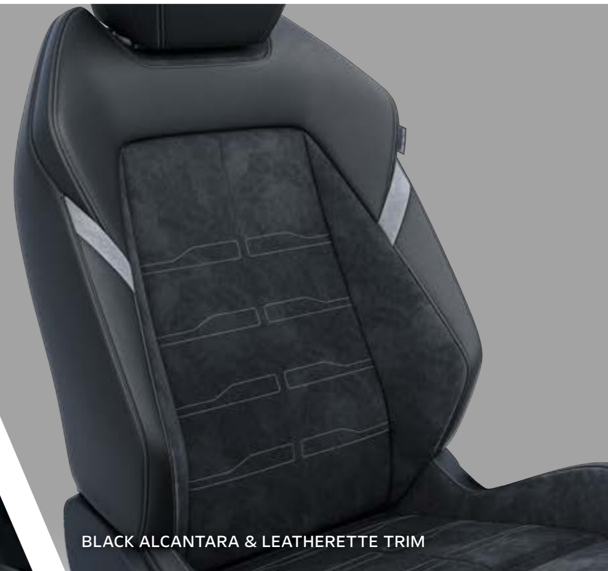
BLACK ALCANTARA & LEATHERETTE TRIM