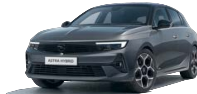
VULCAN GREY - METALLIC