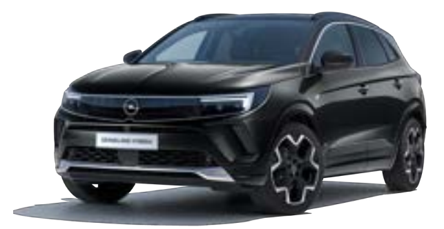
DIAMOND BLACK - METALLIC