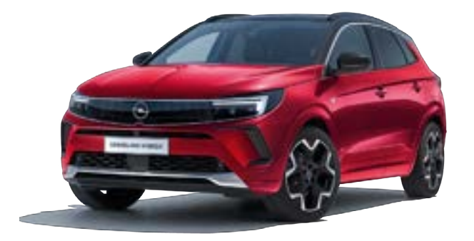
CRIMSON RED - METALLIC