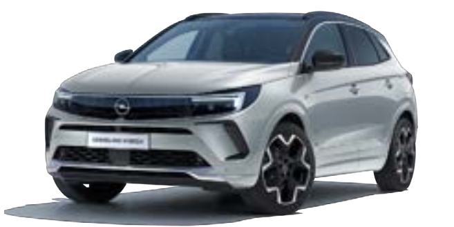
QUARTZ GREY - METALLIC