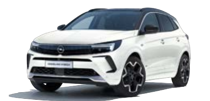
JADE WHITE - SOLID