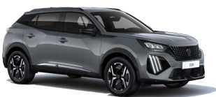
Selenium Grey (M0LD) metallic $0