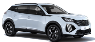
Okenite White (M0SU) metallic $550