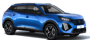
Vertigo Blue (M6SM) pearlescent $950