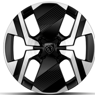
17" 'KARAKOY' Alloy Wheels (DZHL3) Diamond Cut