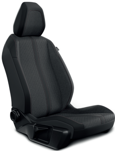
'Casual Lomsa' Seat Trim Standard