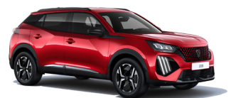
Elixir Red (M5VH) special $950