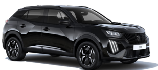
Nera Black (M09V) metallic $550