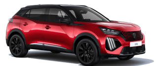
Elixir Red (M5VH) special $950