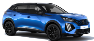
Vertigo Blue (M6SM) pearlescent $950