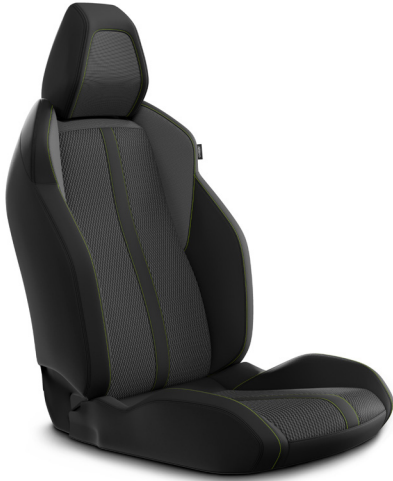
'Belomka' Seat Trim Standard