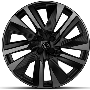
18" 'EVISSA' Alloy Wheels (ZHKP) Diamond Cut Black Mist