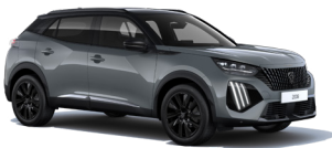
Selenium Grey (MOLD) metallic $0