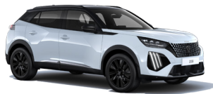
Okenite White (M0SU) metallic $550