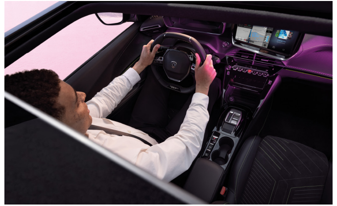
Opening Panoramic Sunroof with Interior Blind Optional Upgrade $2,990