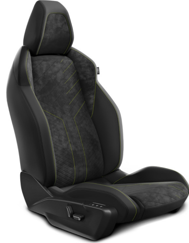
'Alcantara' Seat Trim Optional Upgrade $2,990