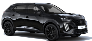
Nera Black (M09V) metallic $550