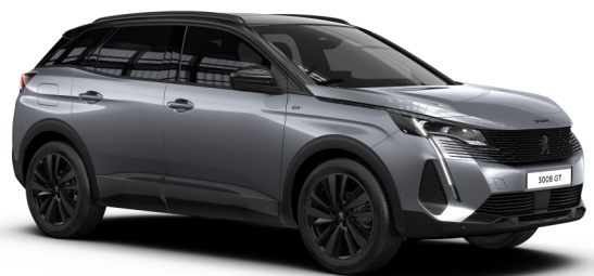
Cumulus Grey (M0F4) — metallic