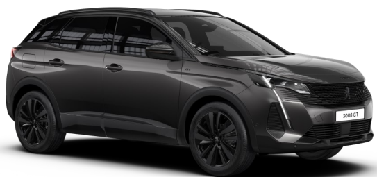
Nimbus Grey (M0VL) — metallic