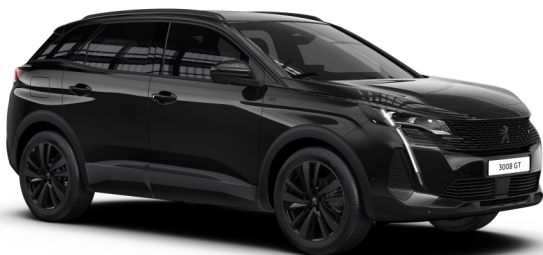
Nera Black (M09V) — metallic